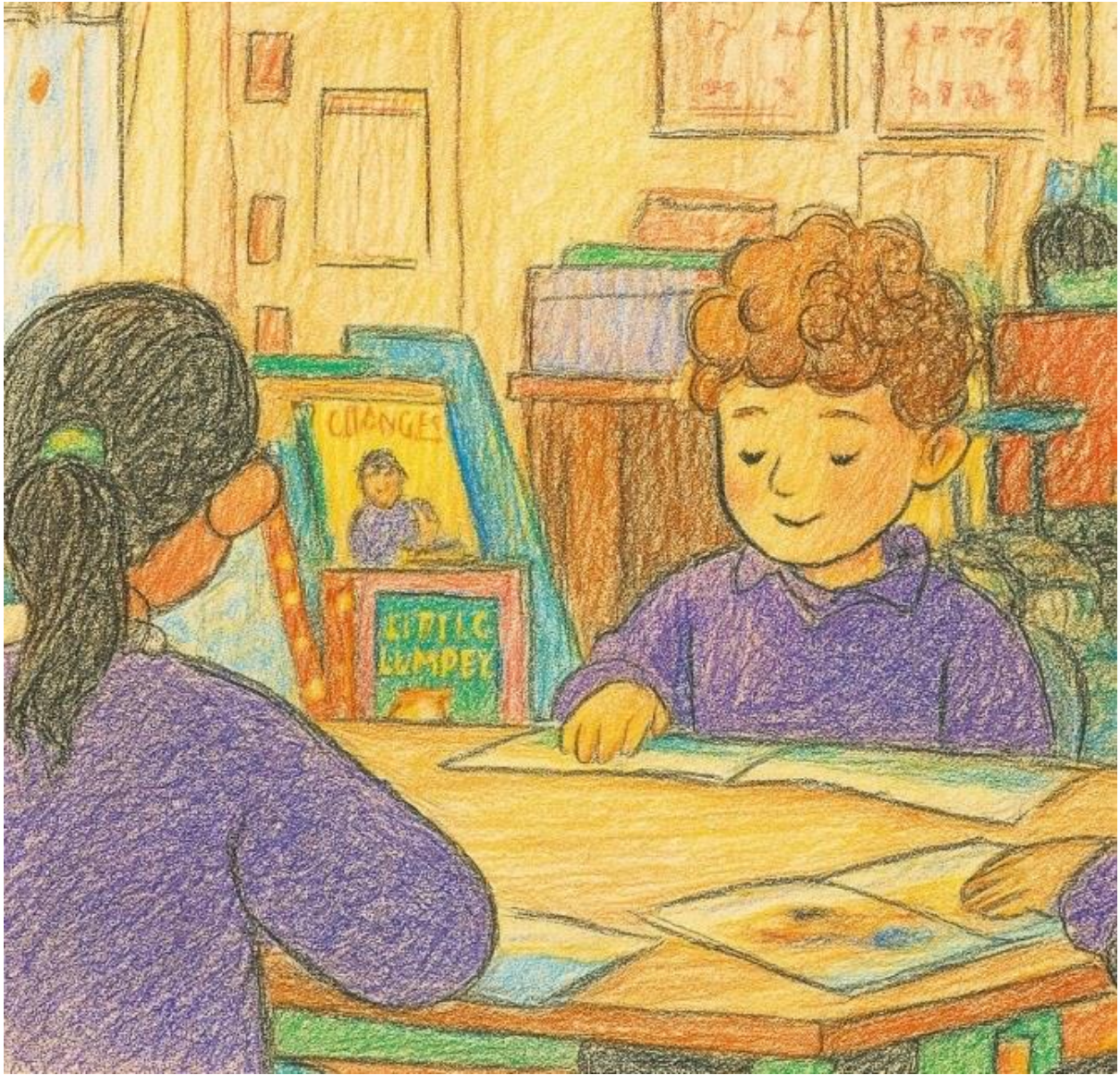
Archbishop Courtenay Primary School - Friday 27th March FB